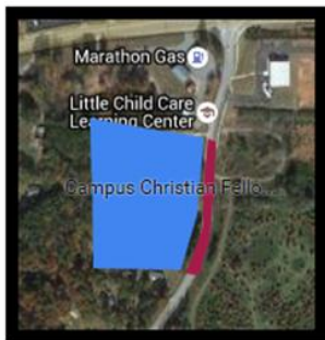
79 & 85 Tyus-Carrollton Rd.