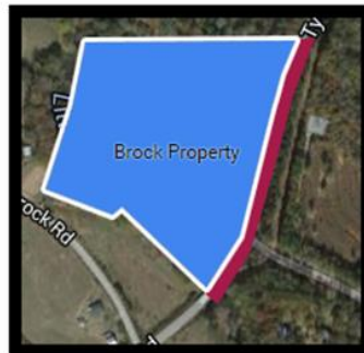
2715 Tyus-Carrollton Rd.