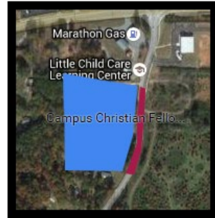
79 & 85 Tyus-Carrollton Rd.