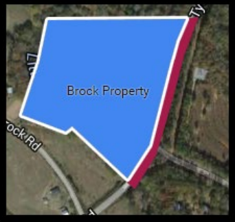
2715 Tyus-Carrollton Rd.