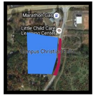
79 & 85 Tyus-Carrollton Rd.