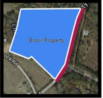
2715 Tyus-Carrollton Rd.